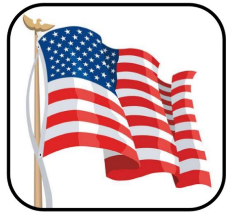
The American Flag

This is the flag of the USA. It is called the stars and stripes and it has three colors.